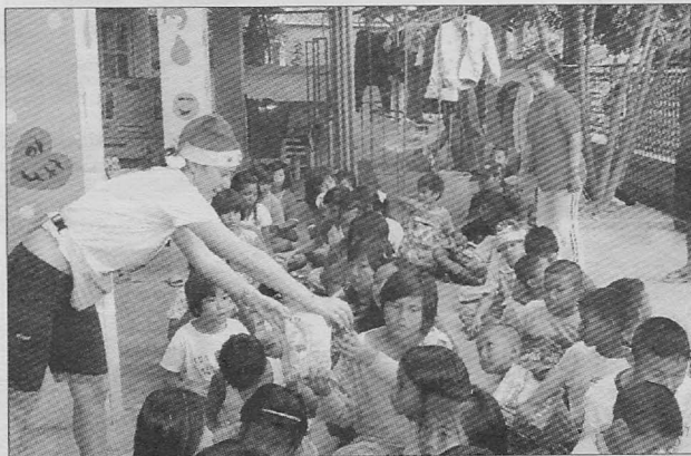
Children from Baan Jing Jai are excited about receiving New Years gifts from the Take Care Kids Foundation.