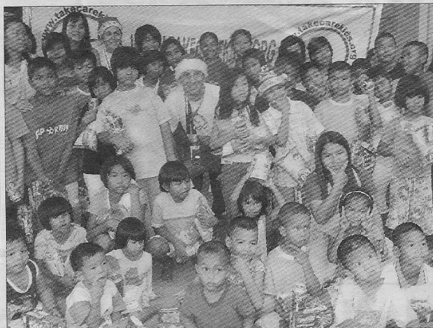
Representatives from the Take Care Kids Foundation pose for a picture with the children at Baan Jing Jai.